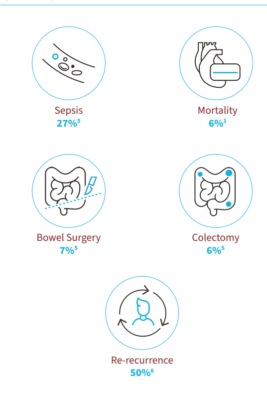
Figure 2. Significant Complications Exist With CDI

severe acute respiratory syndrome coronavirus 2 (SARS-CoV-2) and CDI had a 44% mortality rate.<sup>19</sup> We can only speculate as to what degree CDI contributed to this overall mortality. One study of patients on Medicare with community-acquired CDI documented a 9% mortality rate during their inpatient stay, associated with an initial episode of CDI (Figure 2).<sup>20</sup>