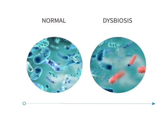
Figure 1. Human Microbiota and Dysbiosis

When the relationship between the gut and its healthy flora becomes imbalanced, dysbiosis results ...leading to an intestinal microenvironment susceptible to pathogenic insult from opportunistic bacteria, such as Clostridioides difficile ( C. diff )—capable of causing a wide spectrum of symptoms ranging from mild diarrhea to sepsis.<sup>7</sup>